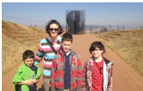
At the Nelson Mandela Recapture site near Durban