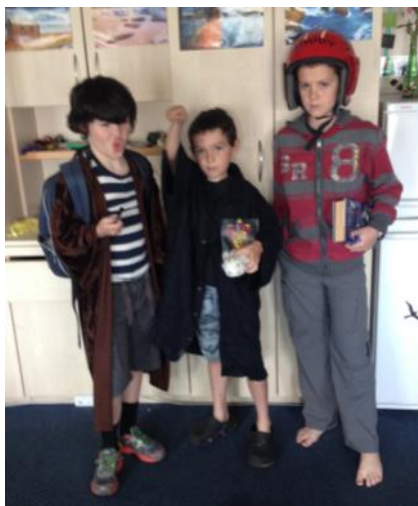
Dressed as favourite book characters for Jubulani Day (L-R) Harry Potter, Sirius Black & Jason Chaser the Hover car racer